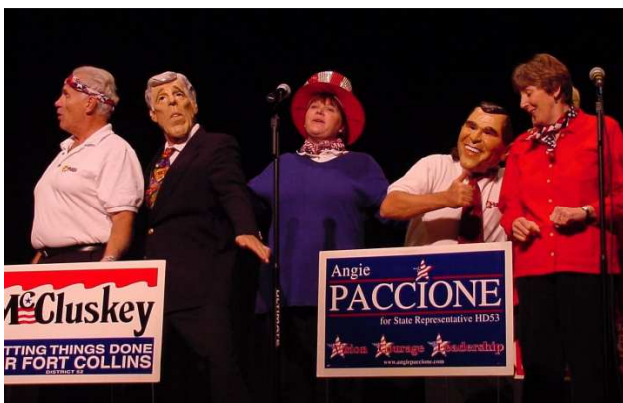
"Election 2004: If God Had Wanted Us To Vote, He Would Have Given Use Better Boobs"

There's reason enough to rejoice For we know that our city is choice And when the sun sets We've only just begun Let's be having lots of fun in the fort In Fort Collins, in Fort Collins, F-O-R-T-U-N that's Fort Collins???